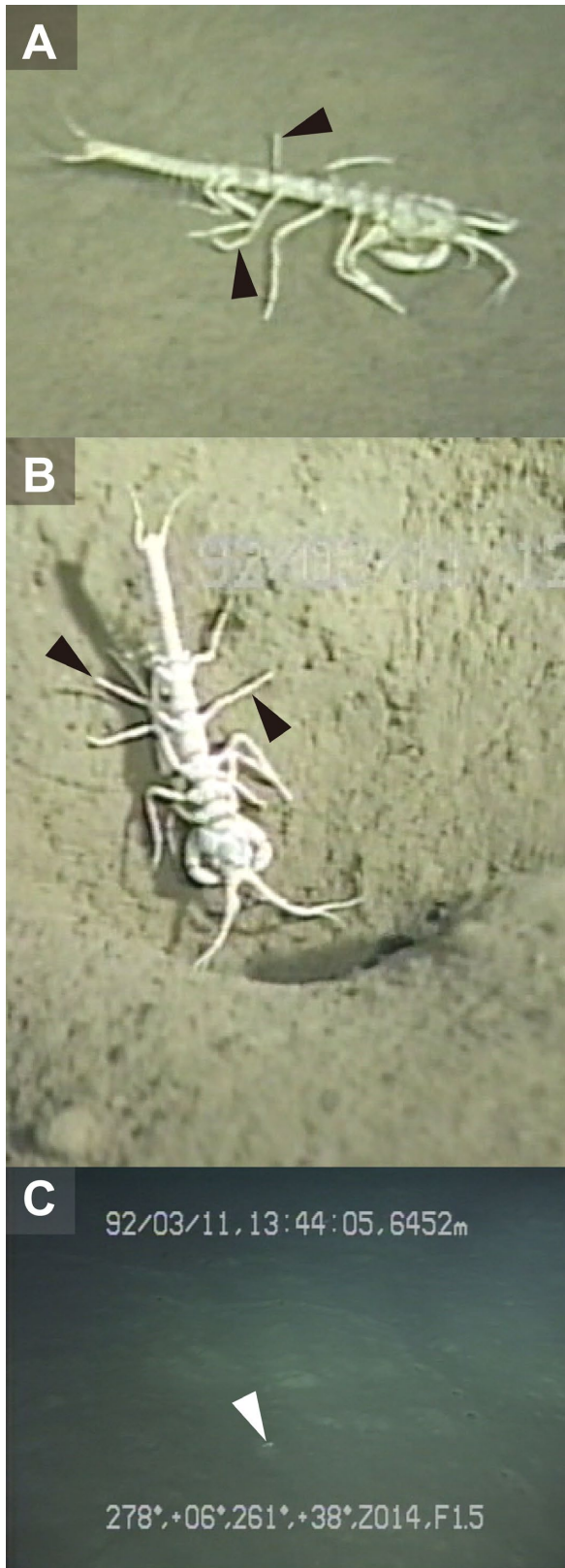
Fig. 1. Video frames showing Gigantapseudes sp. in the Nansei-Shoto Trench, Japan. (A) Individual on the seafloor. (B) Individual at the entrance to a hole. (C) White object (white arrowhead) on the seafloor, possibly a Gigantapseudes individual. Black arrowheads indicate raised pereopods 4.

species of Gigantapseudes Kudinova-Pasternak, 1978 (Apeudomorpha: Gigantapseudidae). Species in Gigantapseudes have the largest body size (up to 75 mm long) among tanaidaceans and have been reported from depths of 5460–7880 m (Kudinova-Pasternak, 1978; Gamô, 1984). Since the two known species in the genus, Gigantapseudes adactylus Kudinova-Pasternak, 1978 and Gigantapseudes maximus Gamô, 1984, are very similar to one another, and it was possible that the tanaidaceans in the video were an undescribed species, we refer to them herein as Gigantapseudes sp. This is the first record of Gigantapseudes from Japanese waters and extends the northern limit of the known distribution of this genus (Fig. 2).