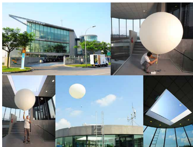
Figure 24: The current Upper Air Station within the 4-story building sharing with the Centre for Climate Research Singapore (CCRS) located at 36 Kim Chuan Road in the central-to-eastern part of Singapore. Top left: The front view of the building; on the top right of this photo, we see the “Launch Platform” where the radiosonde preparation and balloon inflation and launch are conducted. Top right: The inside of the “Launch Platform.” (The radiosonde instrument is prepared at the lower level. See Figure 26.) Bottom left: Just before balloon launch, the ceiling is being opened. Bottom middle and right: Just after a balloon launch.

Radiosonde sounding actually began on 1 August 1954 at 03 UTC (Hassim et al. , 2019) at Paya Lebar. It is most probable that this site is identical to the Tai Seng site (1.340° N, 103.888° E; Figure 23) which was used until December 2011 when the station was moved to the current site just across the road due to land developments in the area. The observatory is now co-located with the Centre for Climate Research Singapore (CCRS) at 36 Kim Chuan Road. The current station (Figure 24; 1.34041° N, 103.888° E, 21 m altitude) is located on the top floor of the modern CCRS building. Table 1 summarizes the radiosonde instrument models used since the beginning of the upper air sounding program (see Gaffen, 1993; MO, 1961; BOM, 1976; Nash and Schmidlin, 1987; Nash et al. , 2011; Jeannet et al. , 2008; and references therein for information on most of these radiosonde models). For radiosonde wind measure-