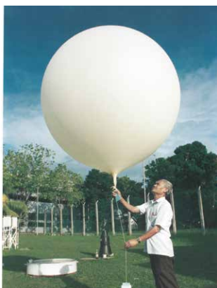
Figure 23: A photograph of the Tai Seng site in Singapore (taken from MSS, 1995). An observer is releasing a weather balloon with attached Vaisala RS80-15N radiosonde (winds from OMEGA global navigation system).