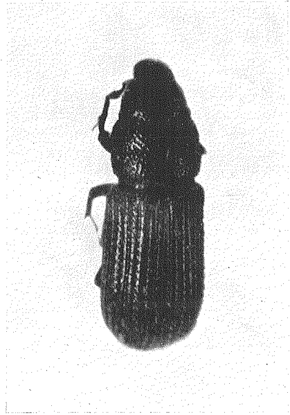
Fig. 2. Stenoscelis longisetosus sp. nov. (holotype).