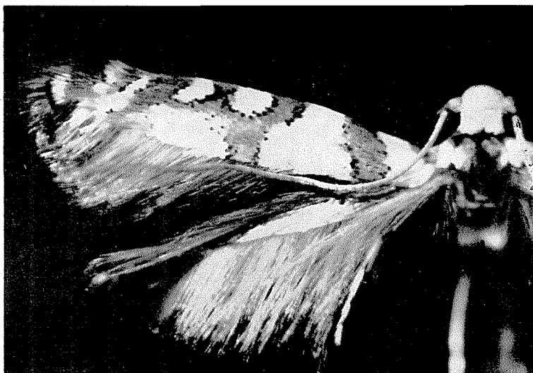
Fig. 2. Spulerina corticicola , sp. nov. (holotype).

Mine: The mine occurs under the epidermis of young shoots, rarely of old trunks, of food plants. In early larval stages it is linear and irregularly curved, while in the latter stages it broadens into a very large, irregular-formed blotch, and finally becomes a linear-blotch mine or ophistigmatonome, being 15–30 cm. in length in the linear part, and 8–13 cm. in the longest diameter of the blotch-formed part. The epidermis of the mine is heavily loosened and discoloured with reddish brown. Frasses are scattered inside the mine-cavity. The cocoon is usually found on the inner surface of the loosened epidermis at the blotch-formed part, rather thick, pale brownish, and similar to that of Acrocercops - and Caloptilia -species in form.