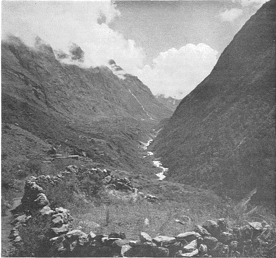
Fig. 4. Langtang Valley: between Ghora Tobela (alt. ca. 3000 m) and Kyangjin Gompa (alt. ca. 3800 m). Habitat of Cicadetta zenobia , which was found on the south-facing slope.

3 ♂♂, Godavari, Phulchoki, near Kathmandu, Bagmati Zone, alt. ca. 1600 m, Aug. 20–21, 1975.