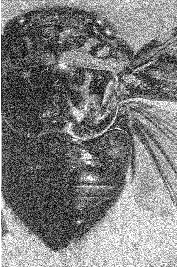
Fig. 1. Suisha himalayana Naruse, n. sp., ♂ (holotype). Body.

roundly produced anteriorly, and the tegmina with the outer margin straight. Differing, however, from Suisha formosana (Kato), the type-species, and Suisha coreana (Matsumura) by the lateral area of the pronotum dilated in a delta-shape rather than convex, and the tegmina slender with the costal membrane scarcely dilated near the base. Further, it is readily distinguishable from the latter two by the tegmina apically with a large maculation crossing the longitudinal veins of radial area and the 1st to 3rd cross-veins and enclosing hyaline spots, and by the wings maculated dark apically but not on the vannus. These characters are shown in Fig. 1 and 2.