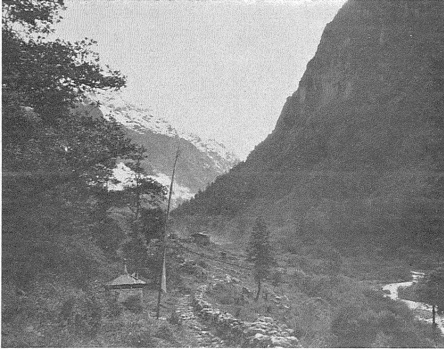
Fig. 3. Langtang Valley: Ghora Tobela, alt. ca. 3000 m. Habitat of Suisha himalayana Naruse, n. sp. Quercus semecarpifolia forest is succeeded by conifer forest of Tsuga dumosa and Abies spectabilis .

alpine conifer forest at an altitude of 3000 m (Fig. 3). Pycna repanda was collected in early October at Thare Pati (3600 m), in an alpine deciduous forest mixed with junipers and rhododendrons, as well as at Sundarijal (1600 m), in a temperate evergreen forest. Such a preference for a cool climate common in all these cicadas may be worth noticing in considering the relationship among them.